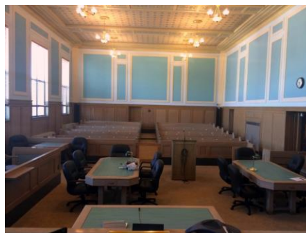
Historic District Courtroom