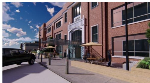
Proposed New South Entry