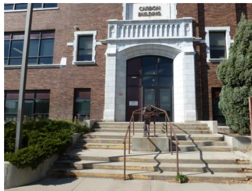
Current South Entry